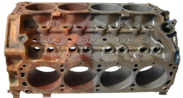
Untreated section of engine block shows severe signs of corrosion. Treated side with Penizine applied will resist corrosion for extended periods.

Penizine Plus: Penizine Plus has all the benefits of the standard Penizine, but contains extra lanolin – for heavier applications such as marine environment.